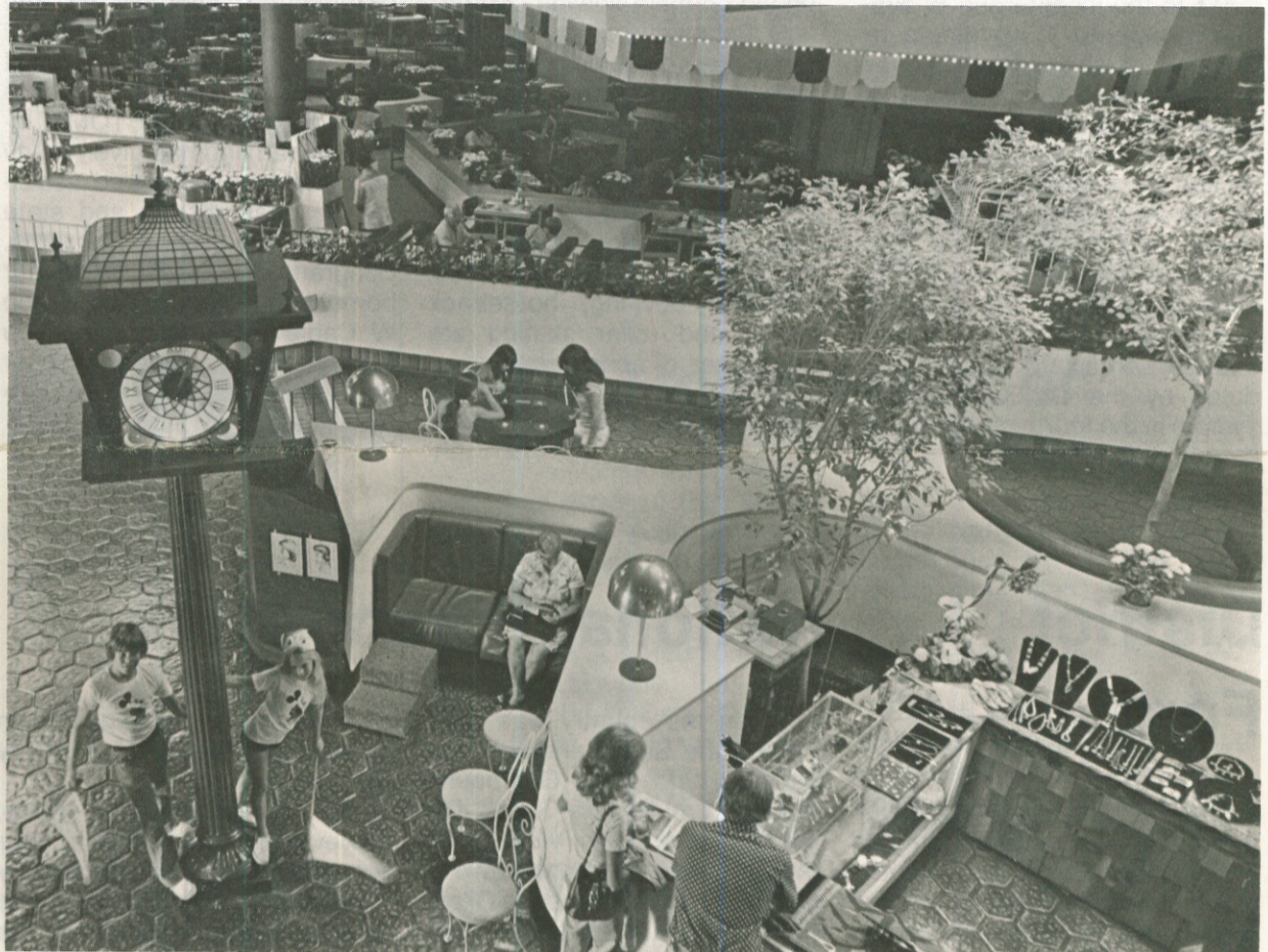
We'll meet you under the clock at the Hyatt Orlando

We're proud to be the best, the keenest competitors and the classiest classicists and we thank FJCL and CAF for bringing us to this time in our lives! Look out State, here we come!