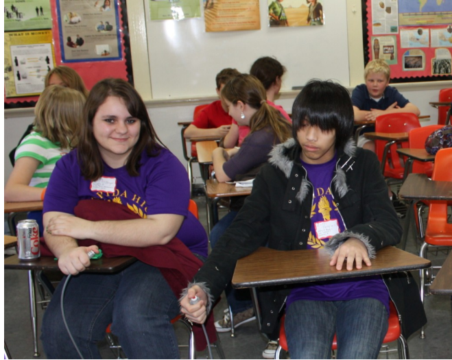
Students participating in Certamen at Regional Forum

Florida’s National team is invited to come and try out. to all those who are participating in Certamen at this year’s State competition, good luck to you all!